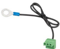
Connector with preassembled DC minus cable (included)